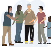
Diversity of Experiences