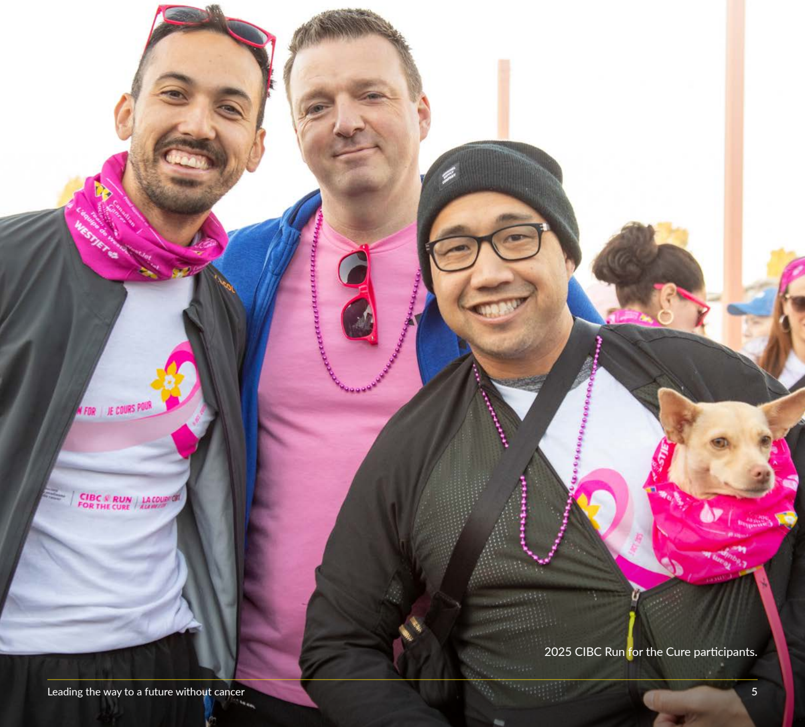
2025 CIBC Run for the Cure participants.

Did you know about 4 in 10 cancer cases can be prevented through healthy living and policies that protect the health of Canadians?